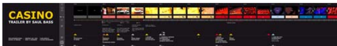
Figure 3: Analysis of a trailer for the film Casino by Martin Scorsese with a pattern based visualization, student's work by Juan Arroyo and Oliver Hochscheid