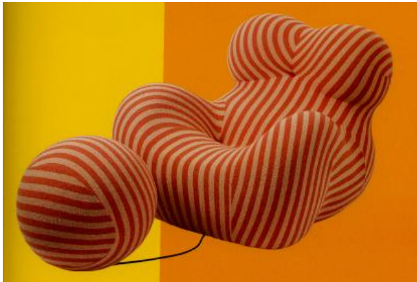
Gaetano Pesce, Chair "Donna con bambino", 1969

Design processes are thereby presented as rhetorical communication. This notion opens up a new way of reading, which deals with the role of design in the social structure. Now, the focus goes beyond the mere product, shifting to the point that products are used as media to address an audience. The design process and the resulting products become an expression of social, cultural, and aesthetic concepts gaining acceptance in a competition of convictions, like we saw in the example of "Donna con bambino". In this process rhetorical techniques are used to form the argumentative strength of an artefact. Any design which refers to the expectations and ideas of the addressee shall be effective and gain acceptance. Audiovisual rhetoric means the competence by which information is structured and presented efficiently resulting in a strong communicative benefit on the side of the addressee. In his latest works on this subject, Gui Bonsiepe (2001) stresses the importance of this aspect for the assimilation and distribution of knowledge within a society. Design, understood as a rhetorical act, is closely interwoven with social communication processes and takes the function of making knowledge available. Therefore, the perspective on a socio-cultural discourse in design opens up, redefining design's function and location.